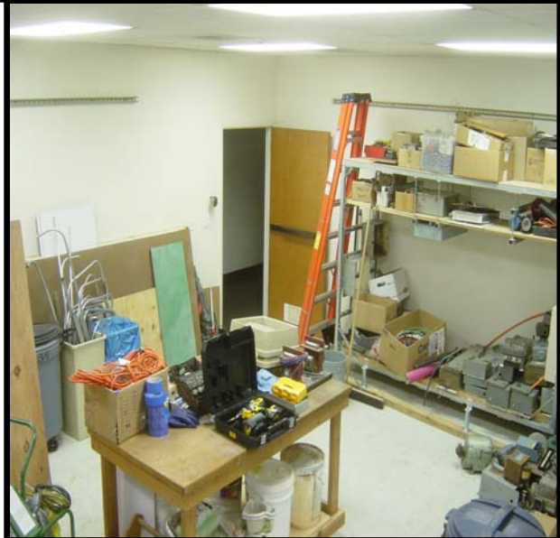
The Training Center workroom "before" picture. You can make a difference in the how it looks after!

project , and I provide you with the materials and directions to build a hands-on training lab that could be put to good use training others in important job skills? Think of the difference your efforts would make in the training of our local I.B.E.W. skilled workforce!