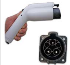
SAE J1772 Connector

The installation of electric vehicle charging stations, also known as EVSE (electric vehicle supply equipment), has begun in Santa Cruz County. Regalado Electric performed the first installation for Coulomb's Charge Point America grant program at Zero Motorcycles in Scotts Valley. Central Electric has installed three charging units at Ecology Action in Santa Cruz at the old Sentinel building. The charging units, manufactured by Coulomb, have two charging points, one Level I (120V) and one Level II (240V). A standard duplex is used for the 120V charging and a SAE J1772 connector is used for the 240V charging. Most, if not all, of the electric vehicles coming to market will accommodate the J1772 connector and also be able to utilize the slower charging 120V. More EVSE installations will happen in the near future under this grant program at the Santa Cruz County Offices, the City of Capitola, and the Community Foundation Santa Cruz County in Aptos.